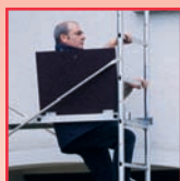
Safe and secure