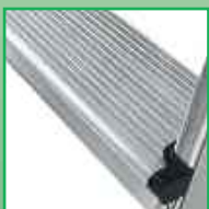
Secure non-slip treads