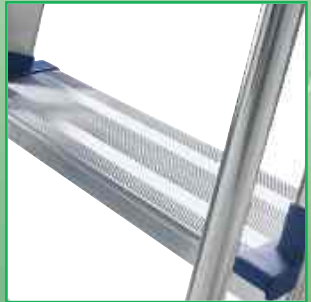
Deep, non-slip treads