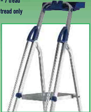
High support rail

Suitable for professional and domestic use