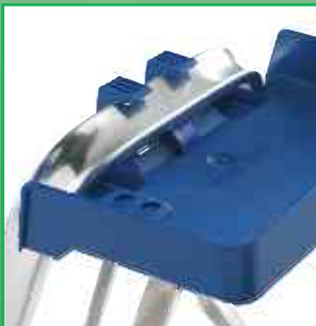
Handy work tray