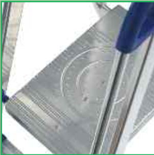
Extra large platform