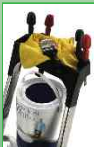
Additional tool tray

Suitable for professional and domestic use