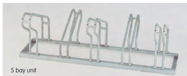
5 bay unit

Alternate side parking; allow for bikes to park either side of rack. Choice of 3 or 5 support tubes Supplied with support tubes laid flat for transport, simple bolt fixings to assemble for use. Supplied for free standing application, can be fixed to floor (fixings not supplied) Extra units can be linked for increased capacity.