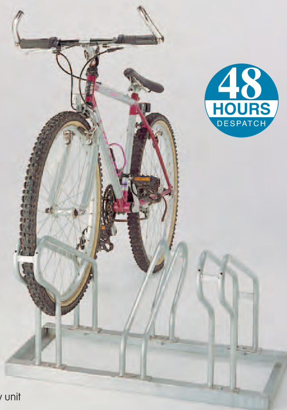
3 bay unit

Type 1 units link together to form multiples of 3 or 5 bays