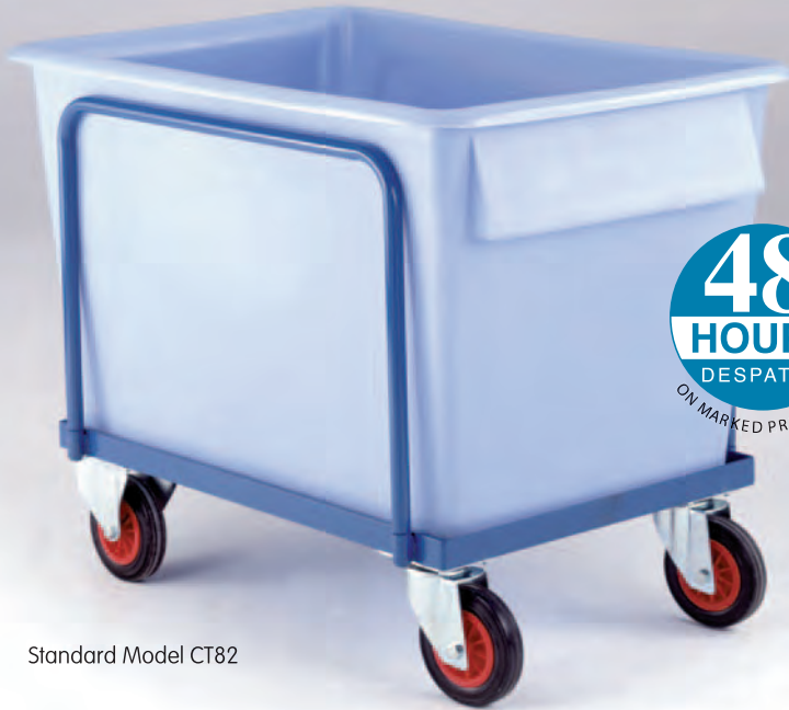
Standard Model CT82