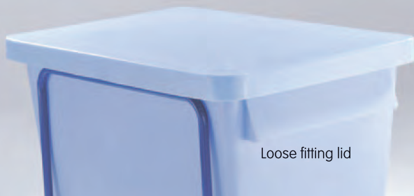
Loose fitting lid

For food grade container trucks, see previous 2 pages