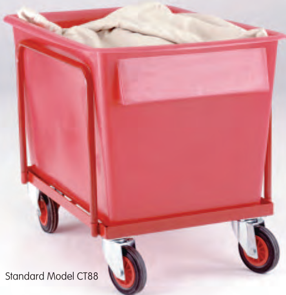
Standard Model CT88