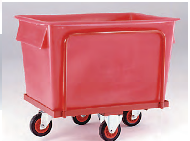
Balance wheel configuration Model CT89

For food grade container trucks, see previous 2 pages