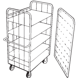
Optional hook on front