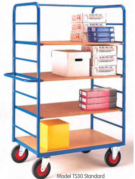
Model TS30 Standard

Overall height 1780 mm. Overall length = Deck length + 200mm 2 fixed 2 swivel castors with 200 mm dia. rubber tyred wheels. Roller bearings. Finish: Blue epoxy.