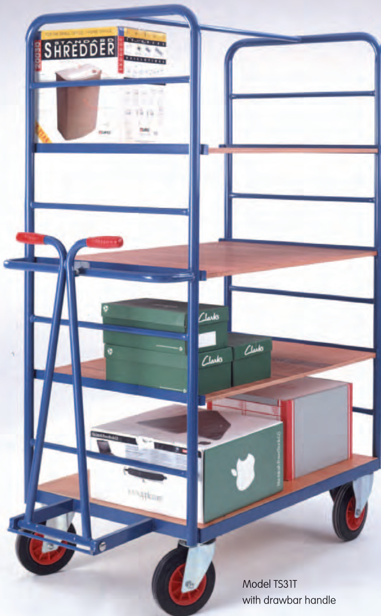
Model TS31T with drawbar handle

Welded angle chassis with tubular end frames. Fixed ply platform plus 3 drop-in ply shelves. 2 standard models. Both available as drawbar version